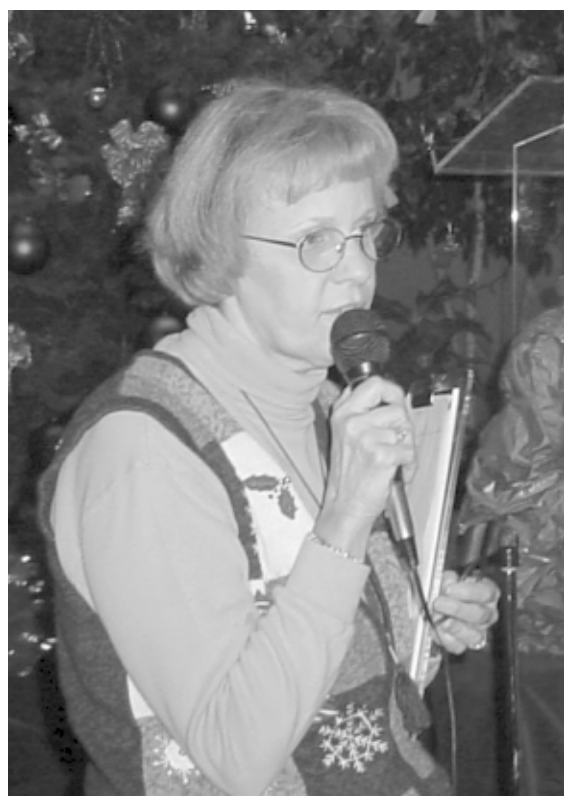
First Day on the New Job

On December 10th, a meeting involving 20 volunteers from a number of quilting and sewing organizations throughout greater San Antonio took place at Central Market on Broadway. During the meeting volunteers who have generously given of their talent, time, and energy in support of the upcoming exhibition at the Institute of Texan Cultures were acknowledged. In addition, those present divided into groups to discuss a number of activities that will be demonstrated during the Transcending 9/11: Quilters' Reflections exhibition. These crafts include Temari Thread Balls, Sashiko, Folded Fabric Flowers, and Origami, as well as additional activities appropriate for children. Group leaders were identified and "how to make" sessions for each of the different crafts are being scheduled for early January. If you would like to attend any or all of these meetings, learn how to make these beautiful craft items, and help prepare kits for demonstrators, please let us know and we will send you the details. Barbara Gilstad (Gilstad@texas.net) or Ruth Felty (ruth_felty@msn.com)Ò