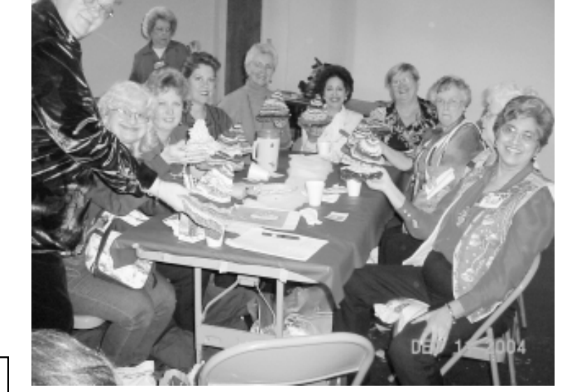
Eat, drink and be merry!