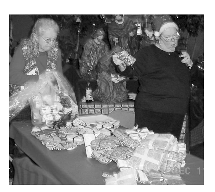
Wonderful Fat Quarter Prizes Galore